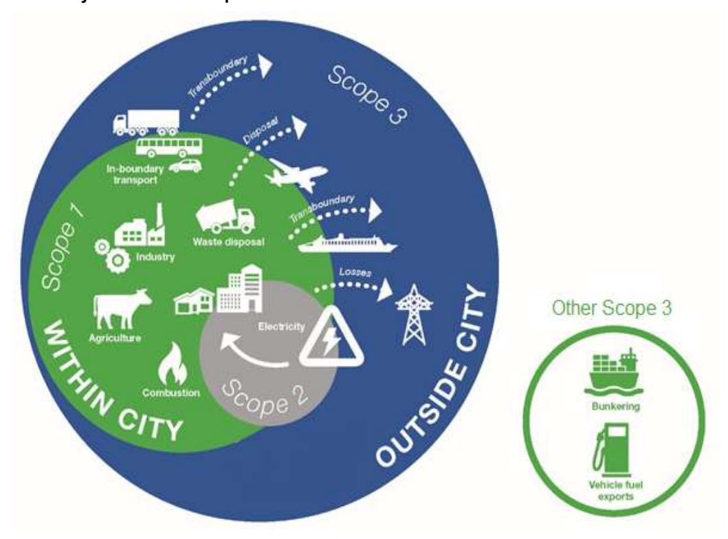
Figure 3: GHG Inventory sources and scopes